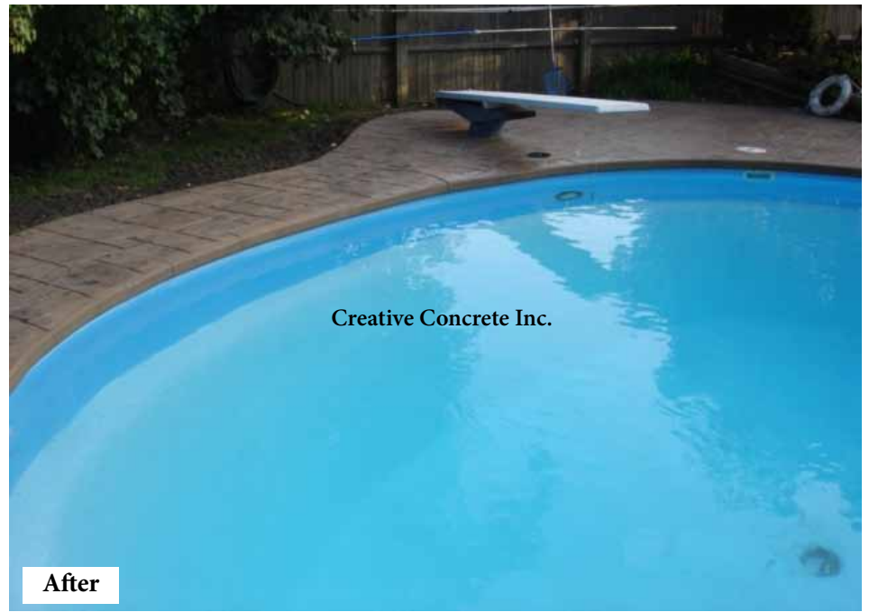
(Concrete Cantilever Edge) to protect the fiberglass walls for the duration of your pool.