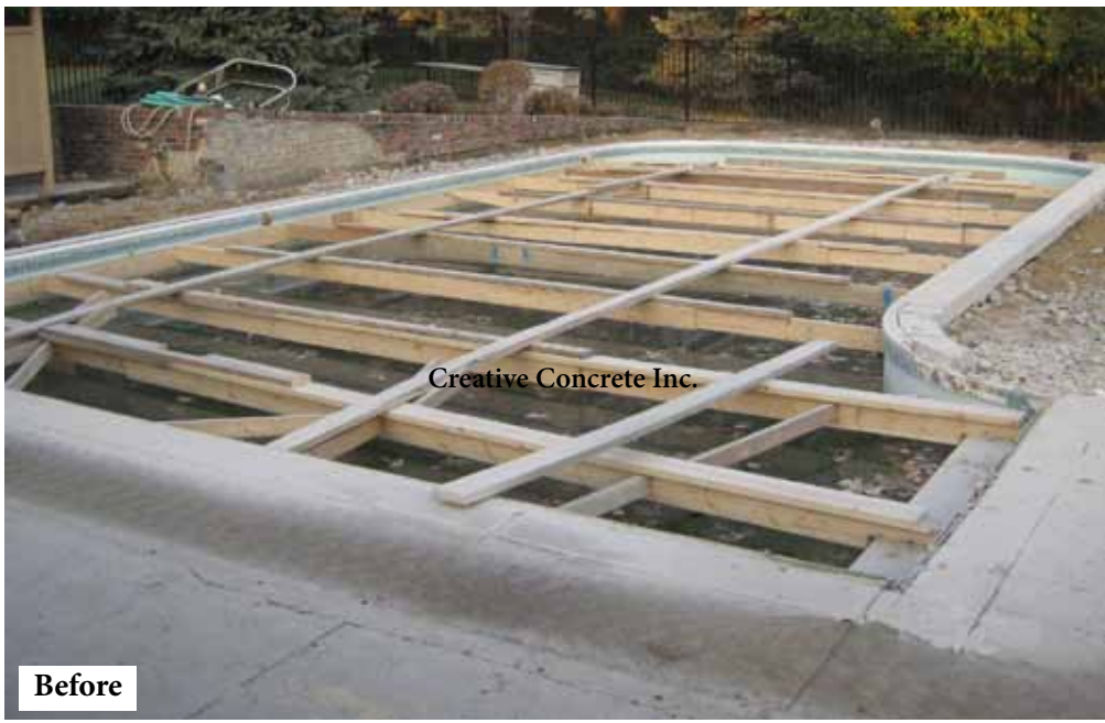
Support the form of the pool in most cases.