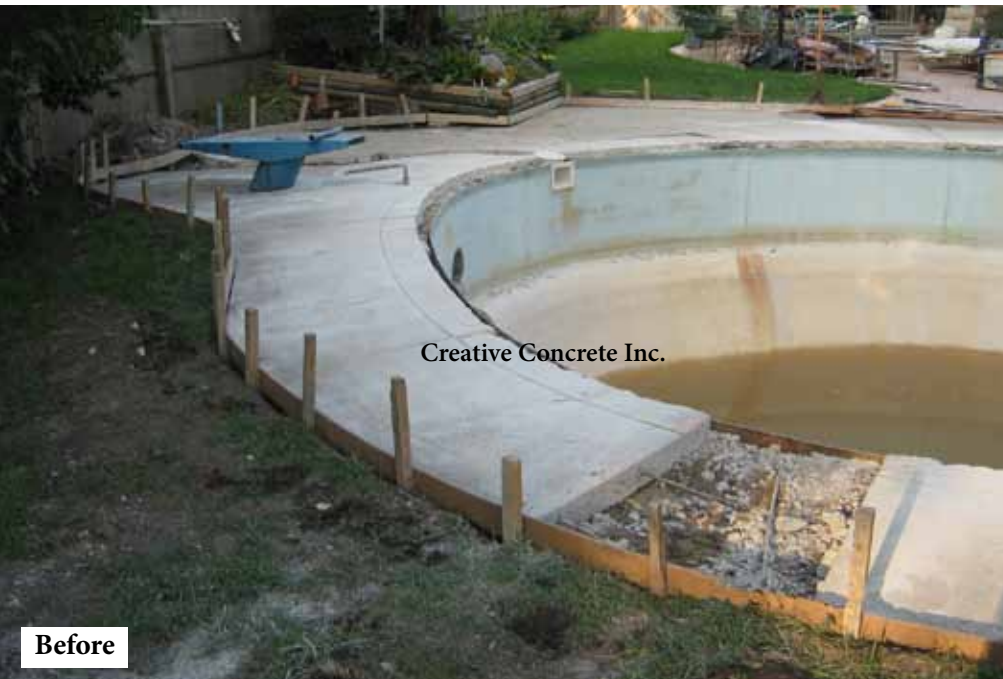
We can remove any settled sections of concrete, fix plumbing, and then overlay the rest with new decorative concrete.