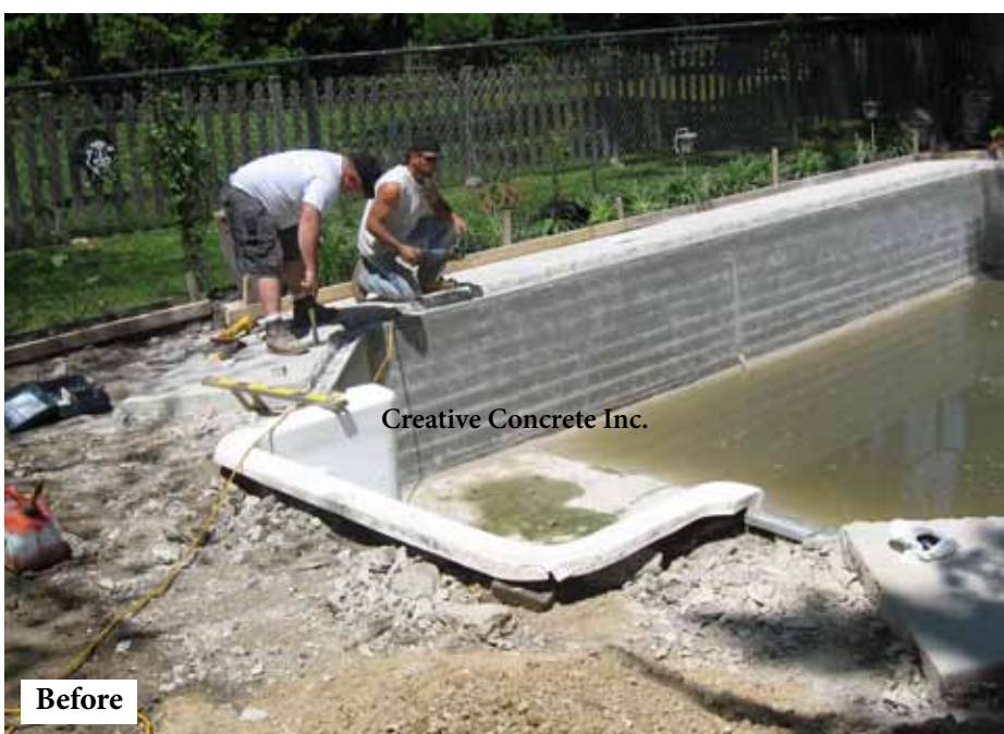
Remove plastic or aluminum coping.

Creative Concrete Inc. 30621 52nd Street Salem, Wisconsin 53168 P: 262-537-4495 F: 262-537-2237 E: repping@tds.net www.1creativeconcrete.com